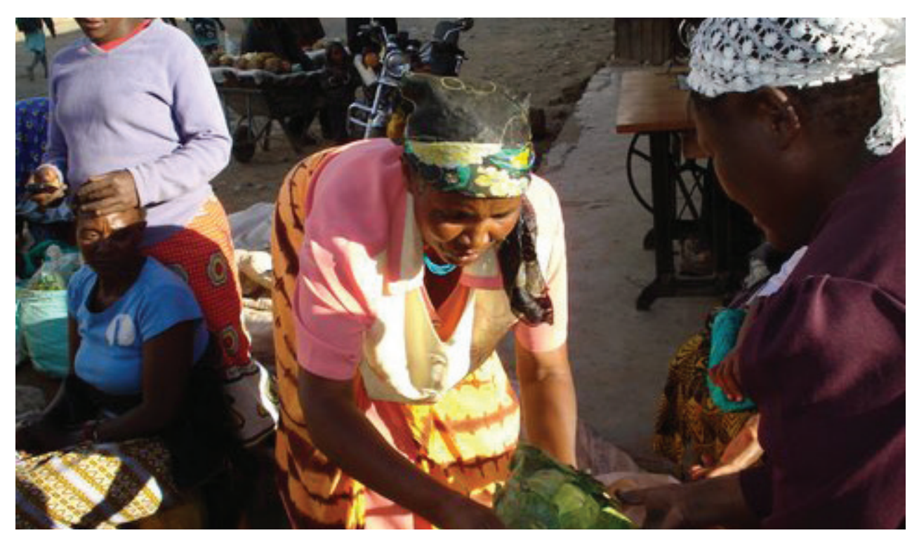
Farmers selling goods on a local market