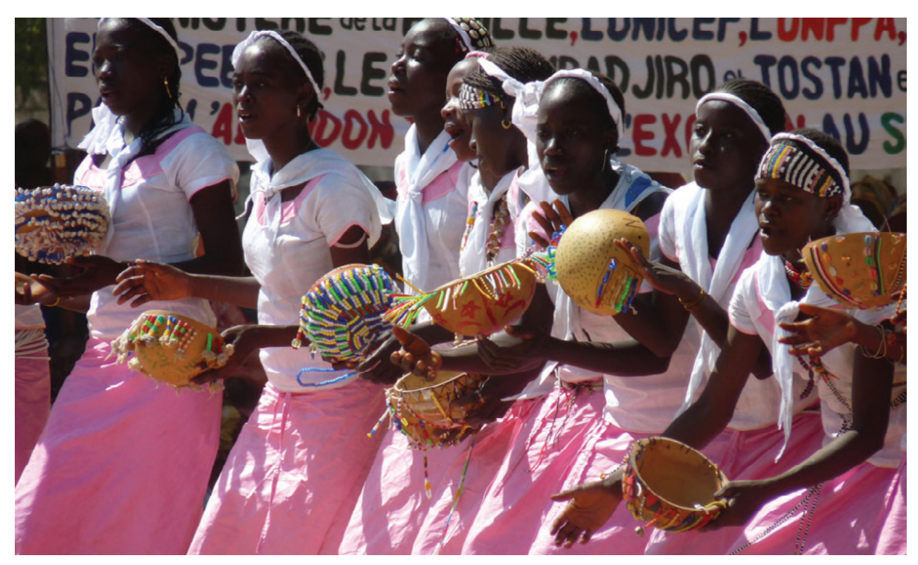
Tostan's Community Empowerment Programme draws on traditional African song and dance

civic education activities outside the classroom, such as theatre groups. This example shows that the women participants and the facilitators had contrasting ideas of what empowering education should consist of.