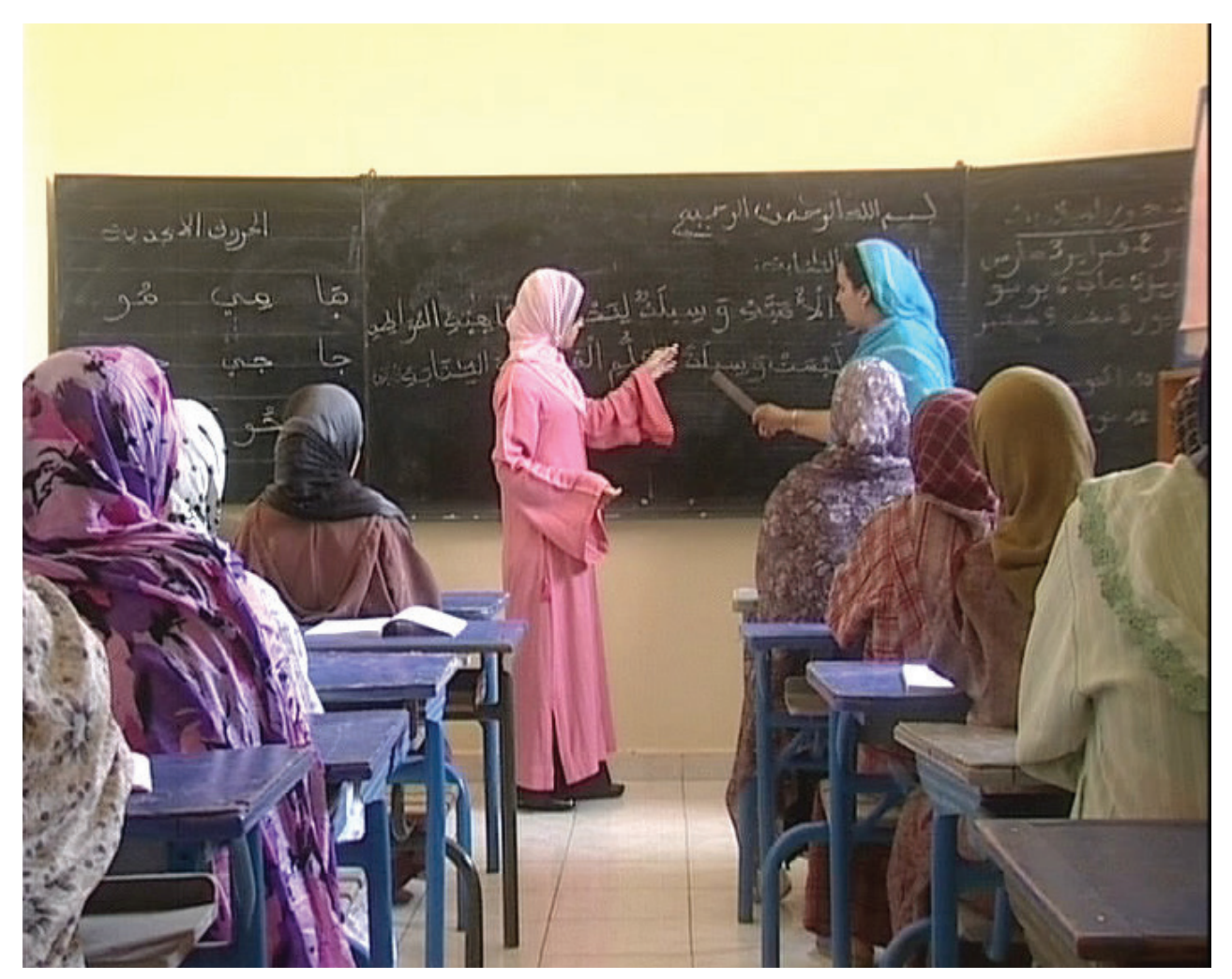
Women of the Argan Cooperative learning about current threats of economic exploitation to the environment

grammes set out to combine at least two of these dimensions - an important part of this analysis is to identify how programmes have developed the synergy between the three dimensions. However, in order to look in more depth at the relationship between literacy and each pillar, programmes have been categorised initially according to which sustainable development dimension is their main focus or entry point.