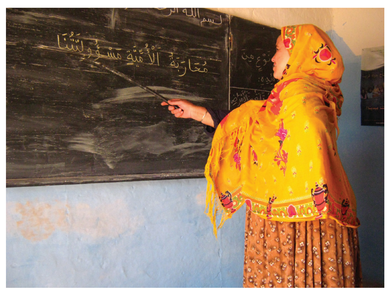
Participant of the Moroccan Functional Literacy Programme of Women of the Argan Cooperative

teamwork, creative skills and interpersonal behaviour. The concept of 'green skills' has also been discussed in relation to soft skills. These can include leadership skills, adaptability to apply new technologies, environmental awareness (ibid, p. 30) and attitude change around the three Rs (reduce, reuse and recycle) (UN, 2012b, p. 26). Young people in particular require such capacities to respond to the rapidly changing and increasingly risky rural agricultural environment, with ever shrinking access to land and resources (IFAD-UNESCO, 2014). However, soft skills alone are not sufficient. UNESCO-INRULED (2012, p. 22) calls for a 'multi-pronged approach' linking literacy skills, production skills (including some specialised green skills for new occupational categories), quality of life components and other support (such as access to credit or legal reforms around land ownership). This more holistic approach to skill development proposes the concept of a learning community, recognising that skill training occurs in 'formal, non-formal and on-the-job settings' (ibid, p. 10).