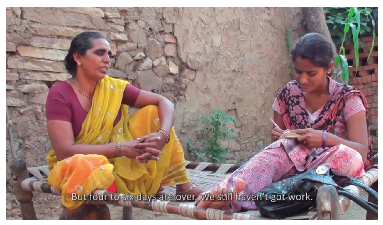
Journalist from the Khabar Lahariya (News Waves) Programme in India

table tunnel managed by a group of 20 learners as a cooperative venture. Literacy is taught through the production of a variety of vegetables as the participants learn to manage intra-group dynamics, organise work rosters, keep sales records, deposit money in the bank and market their products. The tunnels have provided families with both nutritious vegetables and an income. One of the groups has been given a contract to supply spinach to a major South African supermarket.