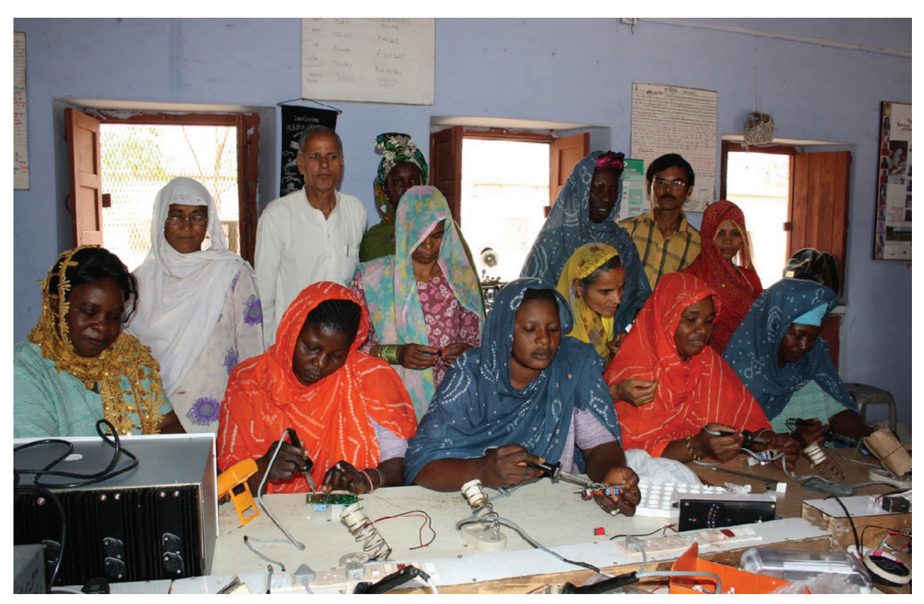
Women participating in the Senegalese Tostan Community Empowerment Programme

mental sustainability remained largely undisputed, 25 years on, sustainable development policies had still not been put into practice due to a lack of political will (UN 2012a, p. 4). Their report (Resilient People Resilient Planet: A future worth choosing) also pointed to the need to develop a 'common language for sustainable development' so that social activists, economists and environmental scientists could begin to work with each other to bring these ideas into mainstream economics (ibid, p. 5). The panel emphasised economic growth as the main imperative for sustainable development and women's empowerment - above the other two 'pillars' (social equality and environmental sustainability) - noting the costs of excluding women from the economy and the need for training to prioritise women so that skill shortages could be met. They suggested that 'the next increment of global growth could well come from the economic empowerment of women' (ibid, p. 6). The report argued that gender equality was an essential dimension of sustainable development, requiring support for women as leaders in the public and private sectors. The panel discussed the role of formal educational and training institutions in capacity building, and noted the potential of 'non-conventional networks and youth communities' (ibid, p. 16), such as inter-