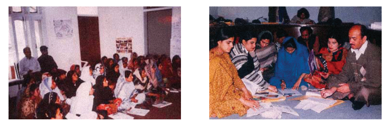
BUNYAD's Adult Health Functional Literacy Programme in Pakistan

duced vocational training in organic farming and livestock training for young women, which were traditionally male areas of study (Eldred 2013: 24). Through women gaining qualifications and employment in these new areas of work, there was the potential to change attitudes more widely around gender roles. Other literacy programmes have also recognised the importance of providing women with the opportunity to gain not only basic literacy skills, but also a qualification that can lead to formal employment. The NGO Association Algerienne Alphabetisation's (IQRAA) Literacy Training and Integration of Women programme in Algeria supports women to empower themselves through gaining a qualification and has negotiated with the Ministry of Vocational Training for their literacy certificate to be recognised. In Brazil, the Ministry of Education's National Programme of Adult and Youth Education integrated with Vocational and Social Qualification took an alternative approach. It worked within the formal education system to challenge the historical dichotomy between basic education and vocational training and to refocus on family agriculture through using a Freirean approach and the notion of work as social practice.