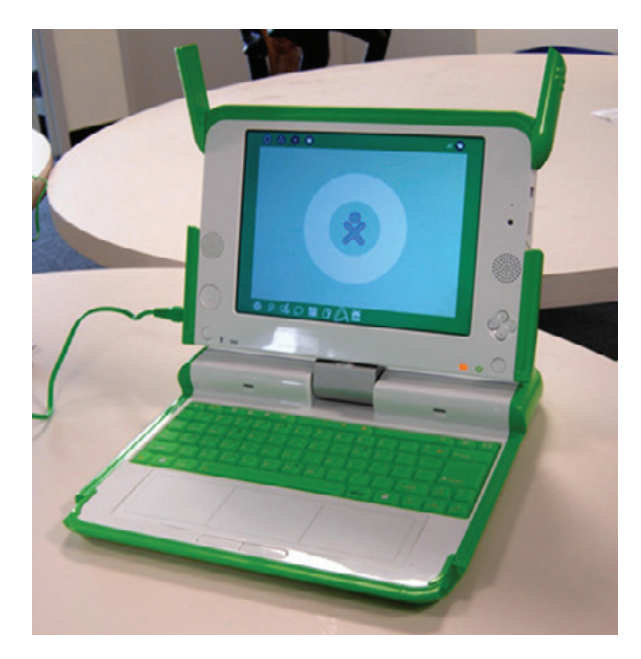
XO computers used in Kenya to empower self-help groups through ICT for alternative livelihood activities

In contrast to projects such as these, which were all implemented within local communities, the NaDEET (Namib Desert Environmental Education Trust) Environmental Literacy Project set up an environmental education centre on the NamibRand Nature Reserve in Namibia's southern Hardap Region. Run by a group of environmental activists, the centre works with both children and adults to provide hands-on experiential learning and the opportunity to reflect on their real-life experiences in relation to sustainable living and climate change. The centre also produces publications, including the Bush Telegraph, a youth magazine covering environmental topics with a distribution of more than 18,000 (over half of the readership of the Namibian national newspaper). Their sustainablity booklet series is also available to download in PDF versions. Like the Mayog programme in Malaysia, this project aims to engage a broad range of people – not only non-literate women. Through the booklets, participants can share what they have