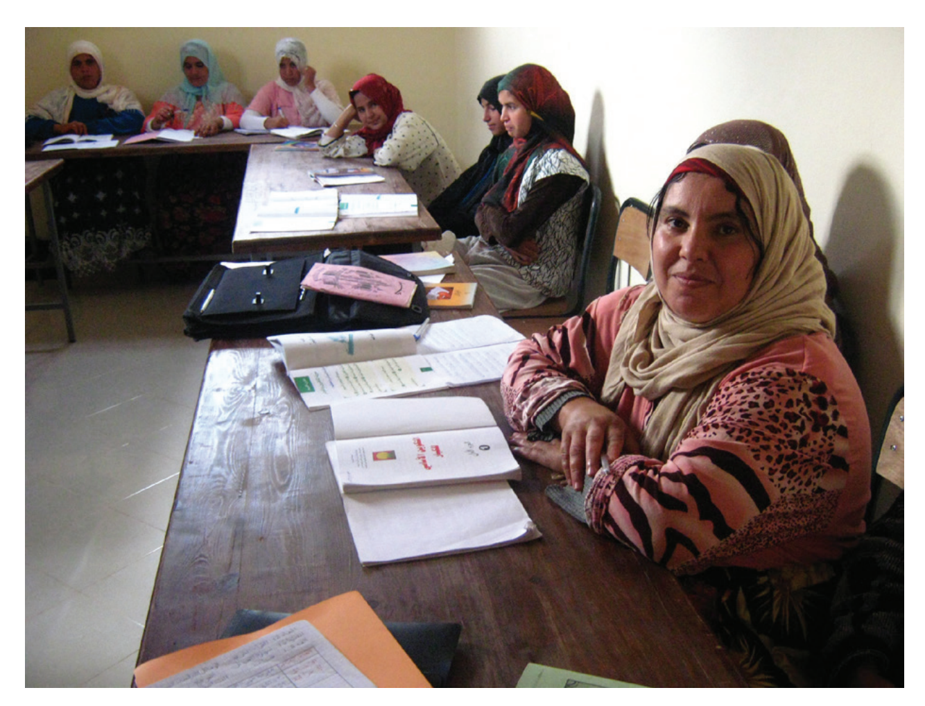
Functional Literacy Programme of Women of the Argan Cooperativ, Morocco

existing knowledge and helped develop their roles and capacities through writing, editing and publishing books for the children in their community.