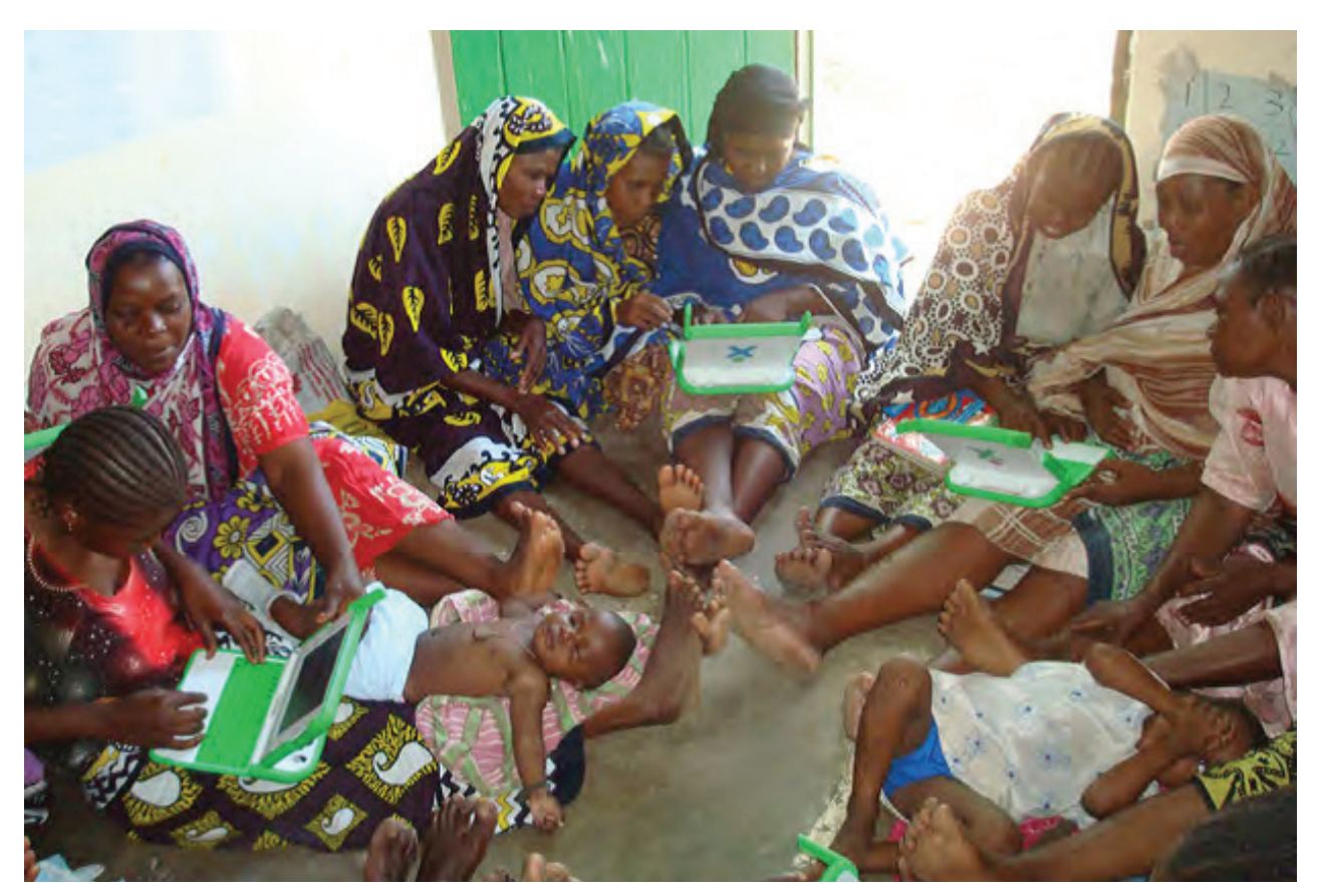
Women learning about preserving marine environments in Kenya using XO computers

is now widespread recognition that 'empowerment means different things for women in different situations' (UIL 2014, p. 3) and that education alone is rarely sufficient to generate such social and political change. However, the tendency to think of 'women's empowerment' as an output rather than a process still persists and this is reflected in the kind of research evidence used to analyse women's empowerment. Statistical measures of women's literacy, decision-making and economic participation have a greater influence on policy than ethnographic insights into how women's lives and identities are changing. As Sholkamy (in DFID 2012, p. 9) has suggested, we need to move beyond a mechanistic notion of women's empowerment to a deeper understanding of both policy and practice: 'Women's empowerment is often treated by international agencies as something that can be designed as a policy blueprint, rolled out and scaled up. What actually happens when policy is conceived, negotiated and shaped may be altogether different'. This relates also to our earlier discussion on the practical difficulties of implementing critical literacy pedagogies on a large scale and the unanticipated ways in which participants and staff may shape a programme at local level.