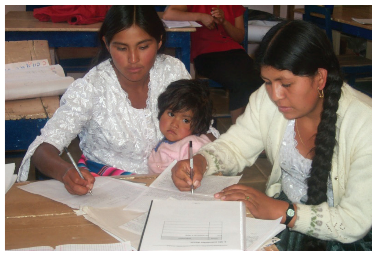
The Ministry of Education, Culture and Sport's 'Bilingual literacy project in reproductive health' in Bolivia