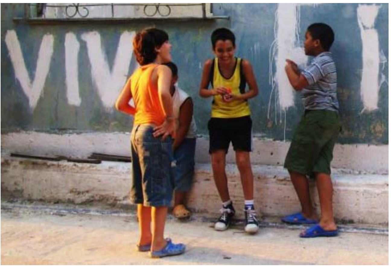
Cuban street children

The idea of the title for this activity comes from the young people who took part in the Deloitte Street Child World Cup. You can hear one participant talking about how he feels via either of these links: www.streetchildworldcup.org or http:// www.youtube.com/user/StreetChildWorldCup#p/u/10/ WzgzcBKQ8to