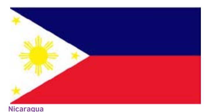
Flag adopted 27 August 1971 (first adopted 4 September 1908)

centre of the white is the wheel of the law of dharma. Truth or satya, dharma or virtue ought to be the controlling principles of those who work under this flag. Again, the wheel denotes motion. There is death in stagnation. There is life in movement. India should no more resist change, it must move and go forward. The wheel represents the dynamism of a peaceful change." (An extract from the preamble to the flag code of India, as posted on the official Home Ministry website of the Indian government.)