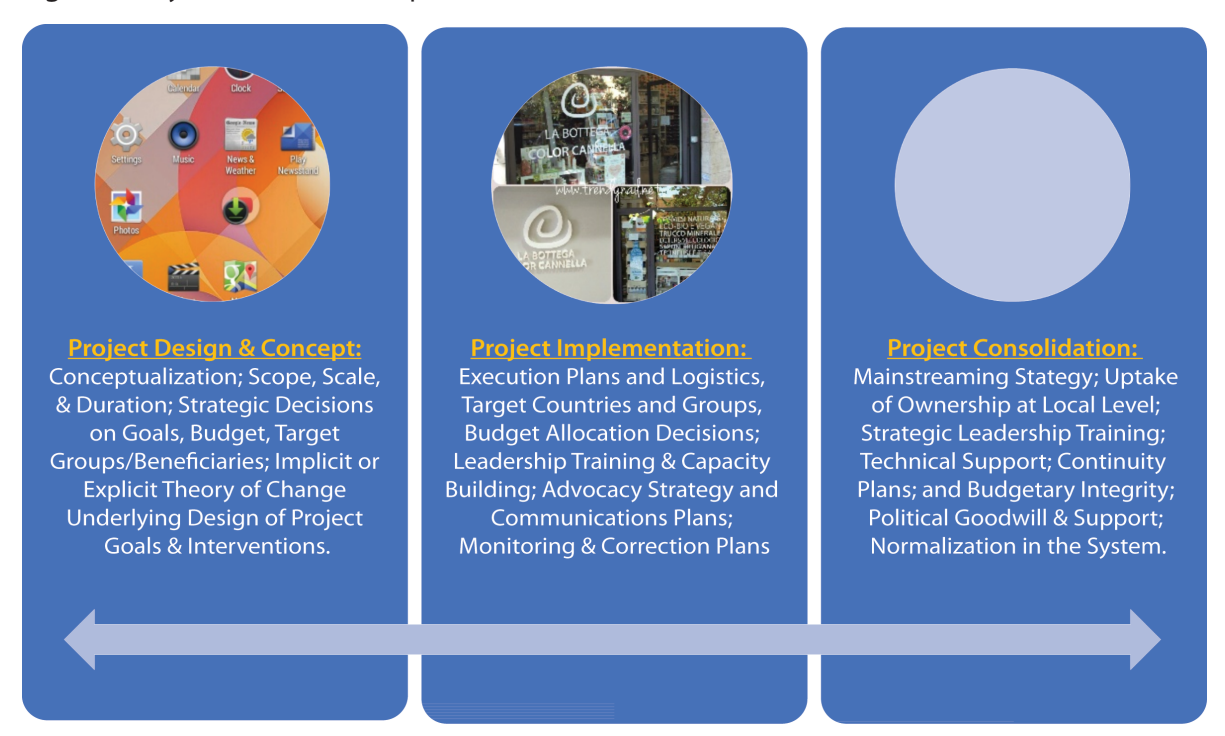
Figure 1: Key Elements of an "Implementation Evaluation"