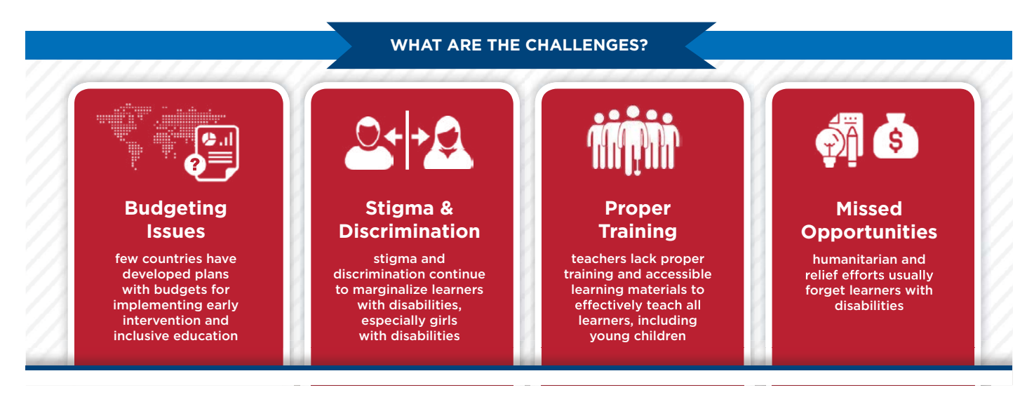
Figure 4: Inclusive education challenges