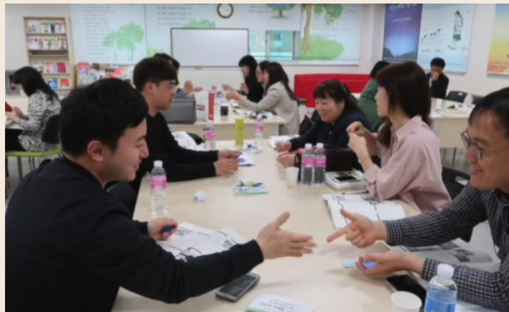
Spread of Teacher-centered Voluntary and Spontaneous Research Group