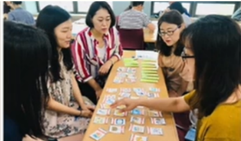
Lead Teachers Program