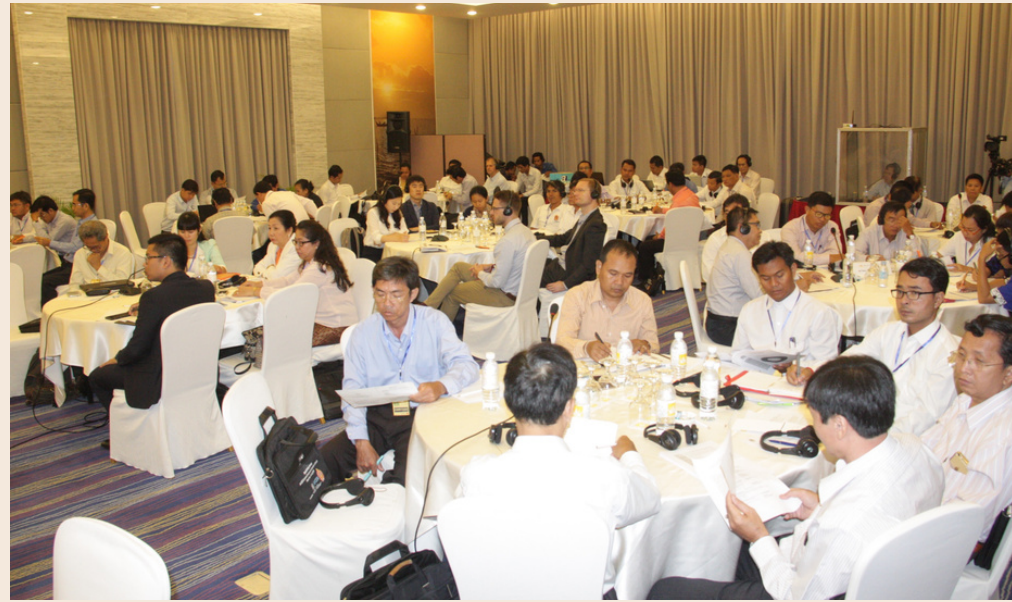
Growing Interests on GCED