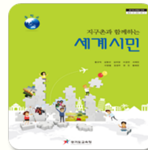
Development and Distribution of Authorized GCED Textbooks