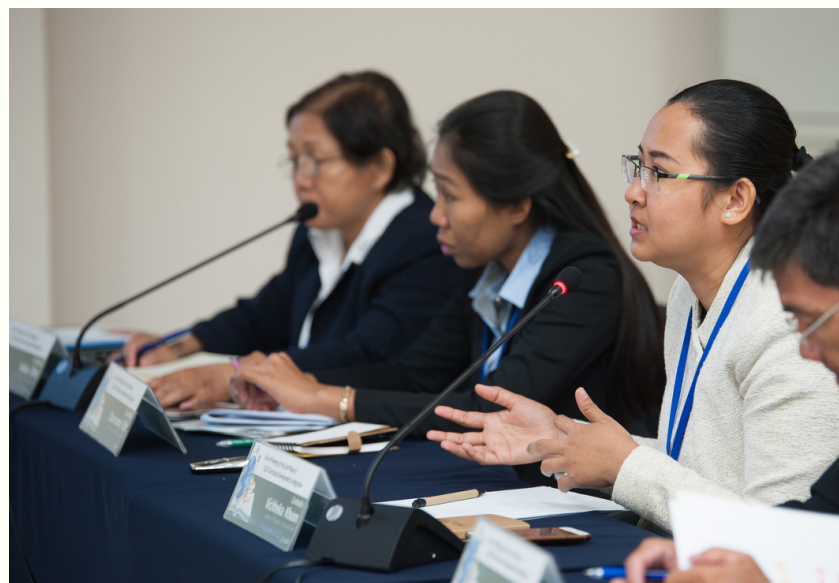
Expansion and Diversification of Policies for GCED

Aligned System of Ministry of Education, Metropolitan and Provincial Offices of Education, and Offices of Education