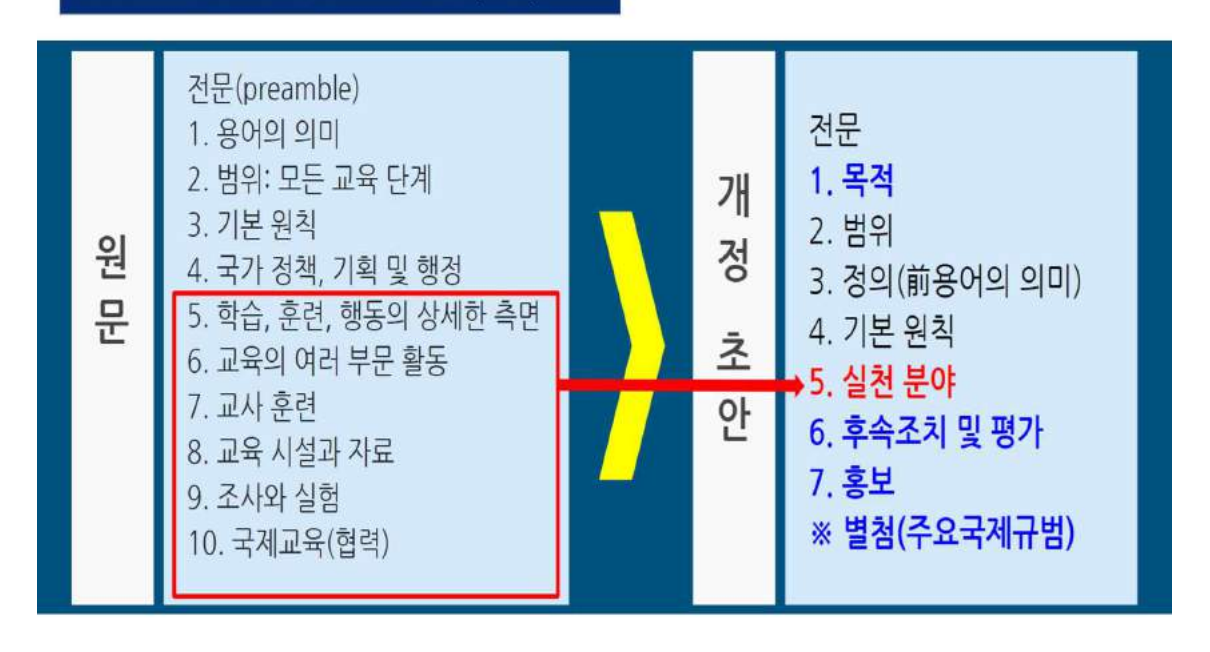
유네스코 1974 국제이해교육 권고 개정안 검토 포럼