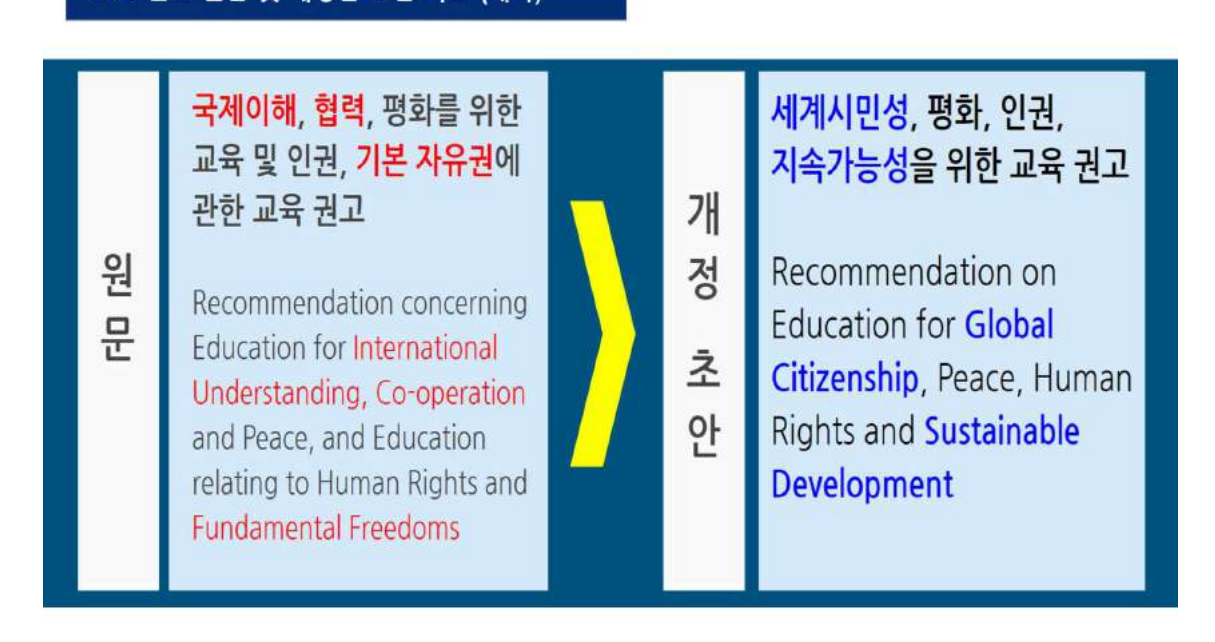
유네스코 1974 국제이해교육 권고 개정안 검토 포럼