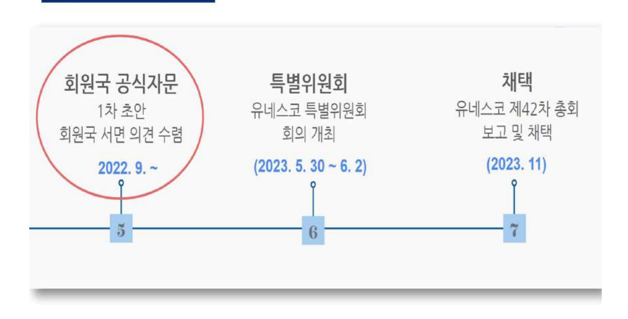
유네스코 1974 국제이해교육 권고 개정안 검토 포럼