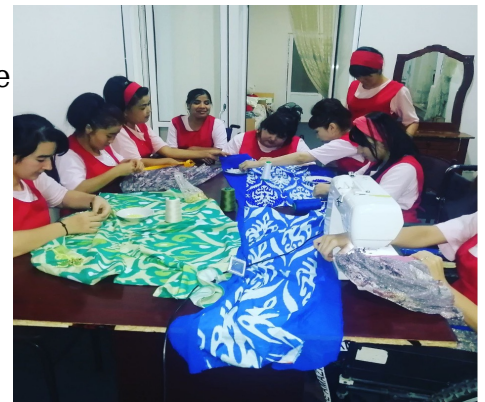
Women of “Gulbahor Nurli Kelajak” at work.

“After this video appeal of mine, we received a lot of practical help. Our building was renovated by the staff of the prosecutor’s office. All conditions were created. Sports equipment was brought for us. We were provided with modern equipment, conveniences were created. It was a big step for the development of our enterprise. We were given advice and a lot of practical help to develop our activities,” says Dilafruz. - says Dilafruz.