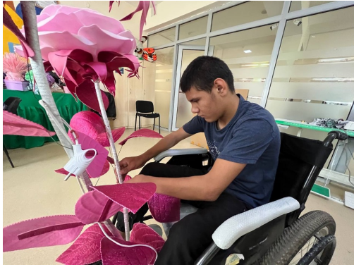
One of the beneficiaries of the "Center for Social Protection of the Disabled" at work.