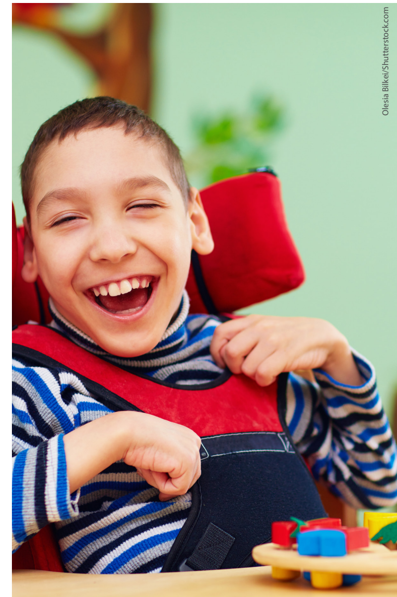
A cheerful child boy with disability at a rehabilitation center for kids with special needs

To build inclusive curricula, and indeed inclusive classrooms, educators in the Arab region need to approach the curriculum from a broader sense. An inclusive curriculum should not only refer to the content of what can be taught, but also the strategies or methods of teaching that can be used when teaching it and the methods of assessment adopted along the way. In an inclusive setting, therefore, not all learners need to receive the same instructions in the same way or at the same time. Teachers do not need to, or should not, use one