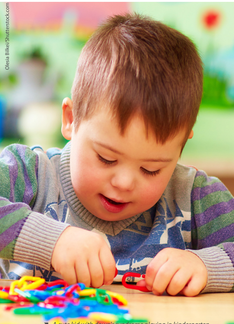
A cute kid with down's syndrome playing in kindergarten

Over the last decades, a number of initiatives have been implemented across the Arab region to increase enrolment, reduce dropout, support children with disabilities to receive quality inclusive education. Examples include: initiatives to support girls' education in rural areas of Egypt, Sudan and Morocco, building inclusive classes in government schools in Oman, Morocco and Jordan, building inclusive government schools in Lebanon, Iraq, UAE, creating regional disability committees in Egypt and establishing government steering groups concerned with disabilities in Jordan, Oman and Palestine. Furthermore, initiatives to develop curricula suitable for the needs of those not able to advance educationally in the general curriculum were also taken in Egypt. Many of these initiatives are joint