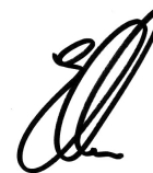
Ellen MacArthur Round the World Yachtswoman Founder of the Ellen MacArthur Foundation

"If we could build an economy that would use things, rather than use them up, we could build a future that really could work in the long term."