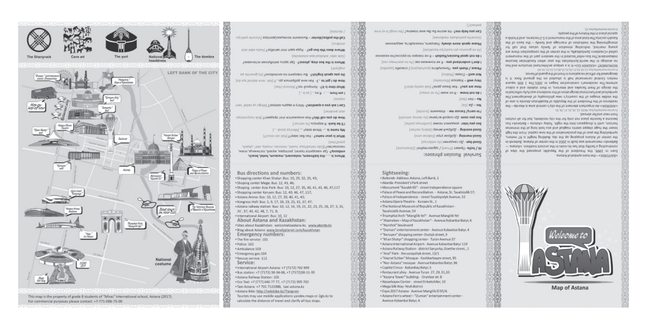
▲ The Map of Astana developed by the students

Students conducted field trips around the city and sketched out directions to transfer to the map. Students then created a development plan and attended extracurricular lessons to learn how to use an image editing software to draw the map. After that, they developed three different designs and considered the strengths and limitations of each version. They consulted with a publishing agency about the inclusion of user friendly and visually appealing information on the map. Students also designed a special stand for distributing the map in the city. To help visitors better understand the local context, students included survival vocabulary, emergency contacts, bus directions, and key information about sightseeing locations.